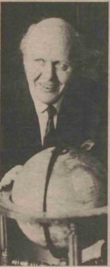
● David Nixon at the Theatre Royal, Brighton.